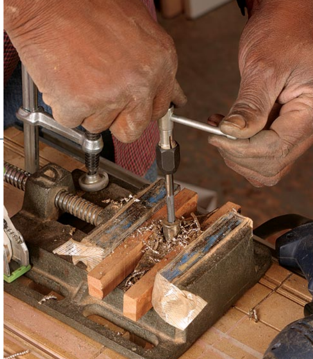
Tap a hole. After drilling a hole in the end of the post, use taps to prepare it for a 10/32 threaded screw that will secure the pull to the drawer front.

be pushed out. Attach a short section to each pull using melted wax.