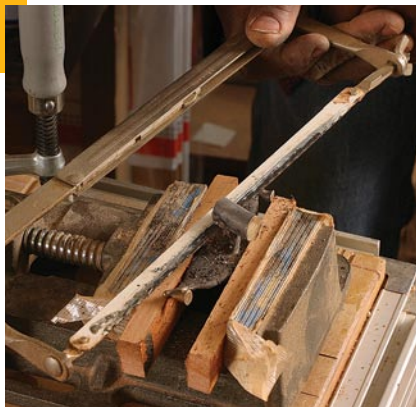
Clean up the casting. You'll need to remove the remains of pouring rods attached at the foundry. Use a hacksaw, and then flatten the base of the pull's post on a grinder or with a file.