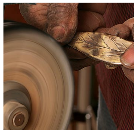
Burnished bronze. Using compound on a buffing wheel gives the pull a mirror finish.