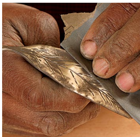
An antique look. Use steel wool and fine sandpaper to remove casting oxidation from the pull. Leave some areas dark for an aged look.

After heating the polished pull with a propane torch, spray 1 tsp. of the chemical diluted in 8 oz. of water onto the hot surface. Continue to alternately heat and spray the surface until you achieve the color you want. After the pull has cooled, buff the surface with 0000 steel wool and then add a coat of paste wax to give it a mellow gloss and protection. □