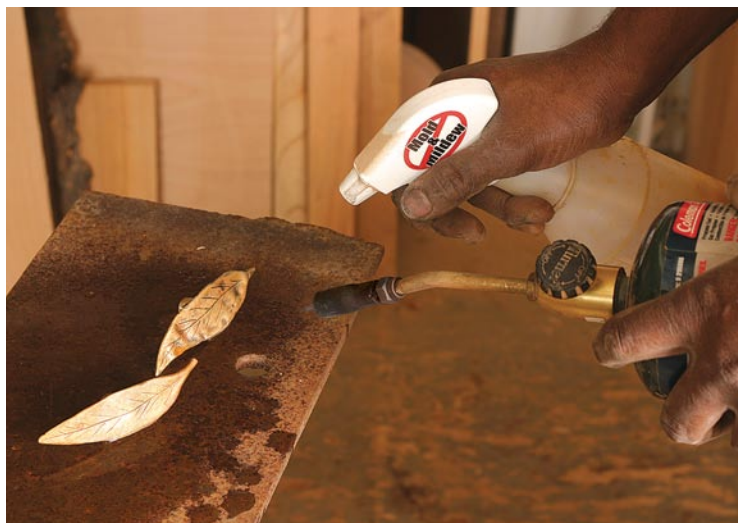
A quick patina. Heating the pull with a propane torch and then spraying on diluted chemicals can give the metal a range of colors.